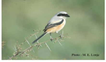
Rufous-backed Shrike Lanius schach Linnaeus