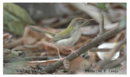
Common Tailorbird Dicrurus caerulescens (Linnaeus)