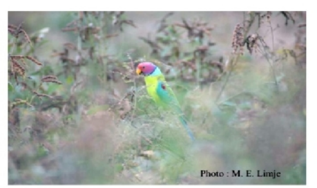
Plum-headed Parakeet Psittacula cyanocephala (Linnacus)