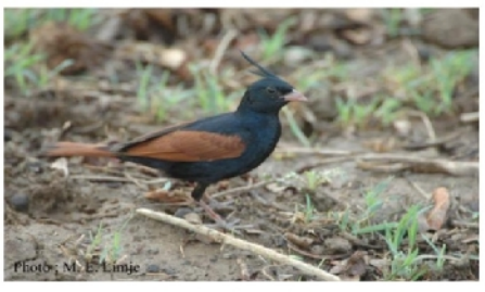
Crested Bunting Melophus lathami (Gray)