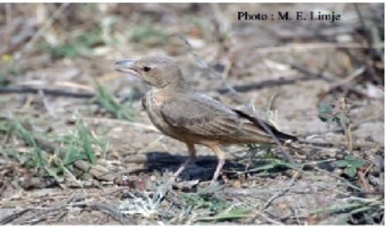
Rufous-tailed Finch-Lark Ammomanes phoenicurus (Franklin)